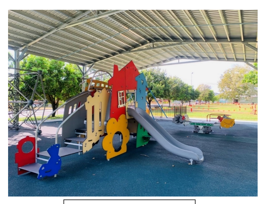
Upgraded playground equipment Mareeba Centenary Park