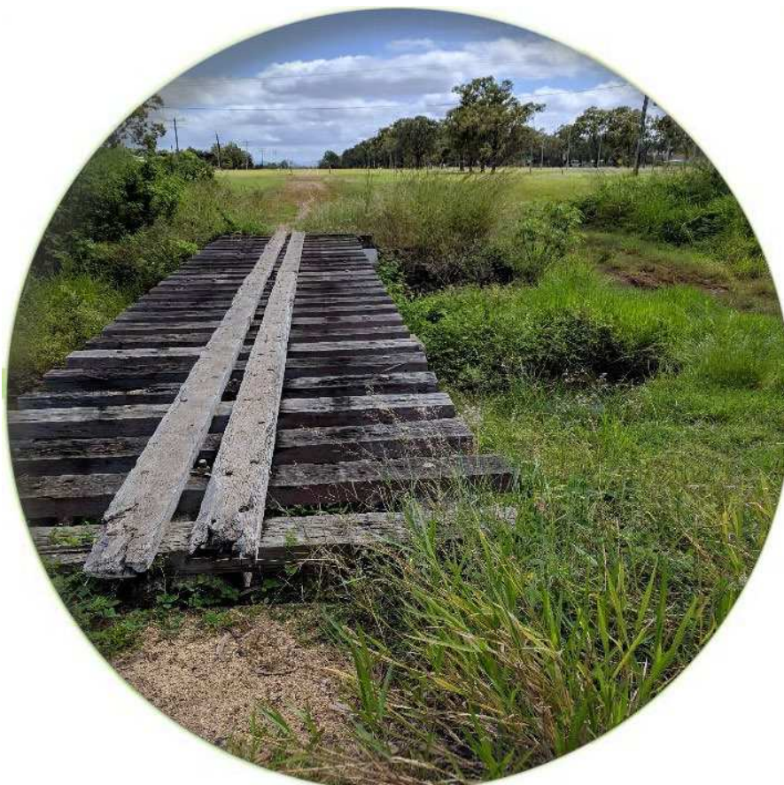
Mareeba Rail Trail