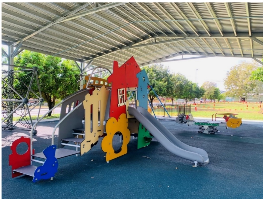
Upgraded playground equipment Mareeba Centenary Park